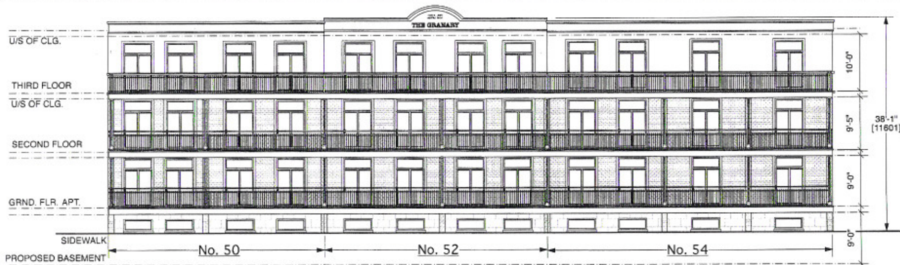
GRANARY: SOUTH SQUARE ELEVATION