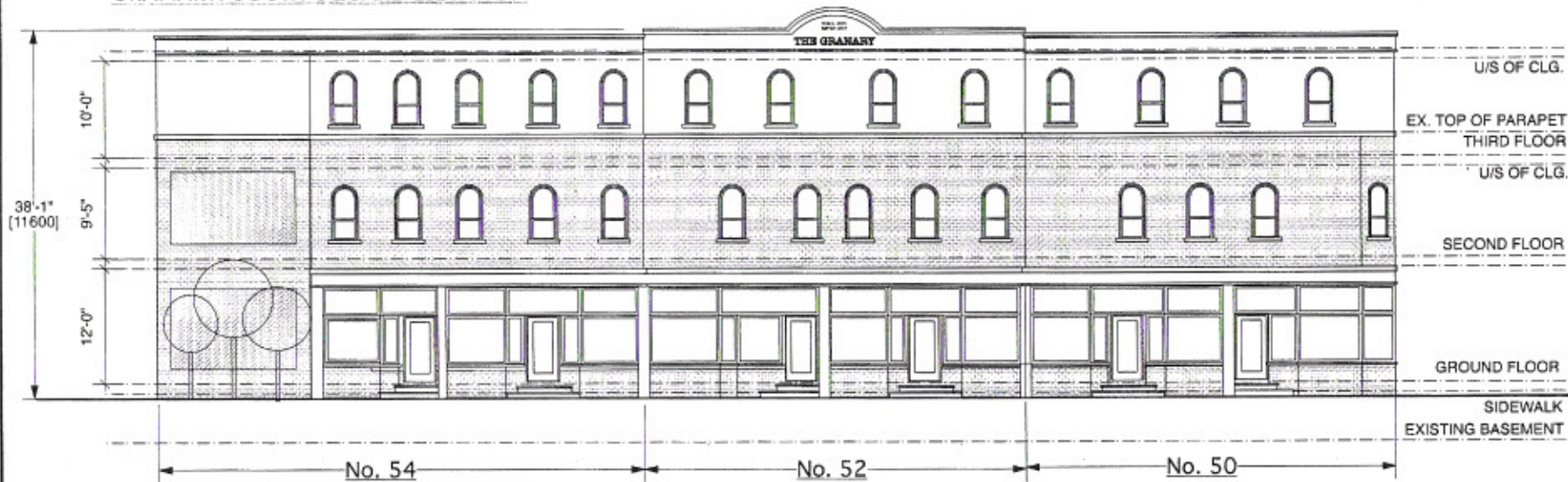
GRANARY: NORTH ELEVATION