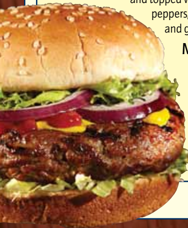
The Classic Burger

Our prime rib burger topped with sautéed onions and peppers, mozzarella cheese and basted with Whiskey BBQ sauce. $10.99