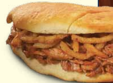
Rustic Pulled Pork Sandwich

Crispy chicken strips, bacon, lettuce, tomatoes, mixed cheese and ranch dressing, wrapped in a flour tortilla and baked in Joe's oven. $9.99