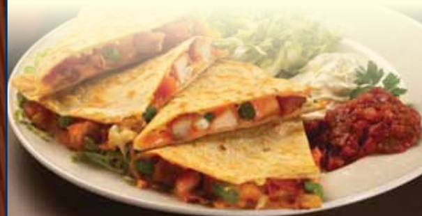
Buffalo Chicken Quesadilla

Our Buffalo chicken quesadilla, chicken wings, moza sticks and crispy shrimp. You're gonna need help eating all of this! $20.99