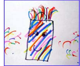
Are you a bucket filler?

school is a great place to learn and grow because of you! A BIG THANK YOU from all of the Northport Cougars.